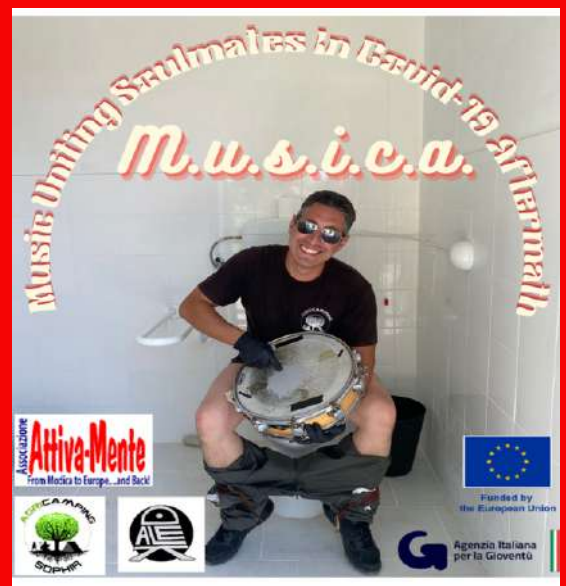
Music Uniting Soulmates in Covid-19 aftermath 2023